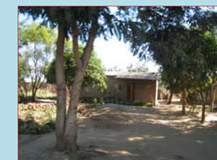
Figure 10 (top): example of rare household material; Figure 11 (middle): ditch near home where standing water may gather during rainy season; Figure 12 (bottom): household with nearby trees.