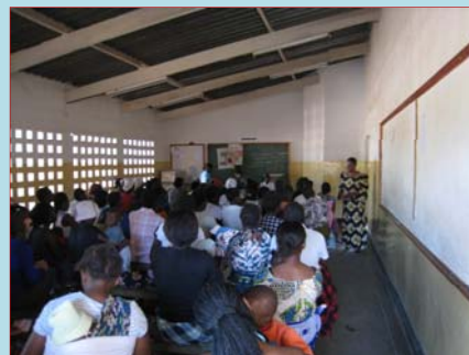
Figure 1: Women at the clinic hear about the vaccine

During the summer of 2009, UNC Project in Lilongwe, Malawi began a malaria vaccine trial aimed at children under five. Similar trials were also set to begin in a number of other Africa countries. What makes the Malawi trial unique, however, is the incorporation of spatial data and analysis for purposes of improving our understanding of vaccine efficacy.