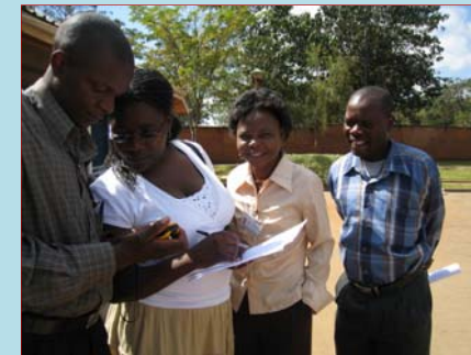
Figure 6: A GPS scavenger hunt, part of the training