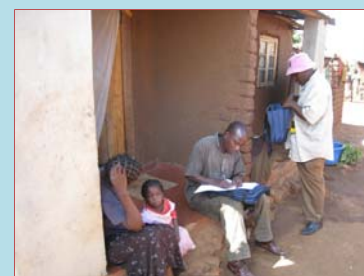
Figure 4 (left): Using forms filled out at clinic to locate household; Figure 5 (above): Taking down additional information after recording GPS point for household.