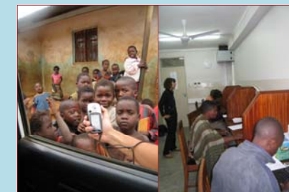
Figure 7 (left): Taking GPS point of a school; Figure 8 (right): Computer-based database and ArcReader training for team