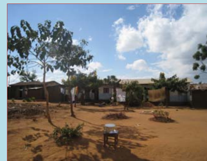
Figure 3: Example of participant home in village

Using the women's reported location (Fig. 4), fieldworkers found the houses to take GPS points (Fig. 5.)